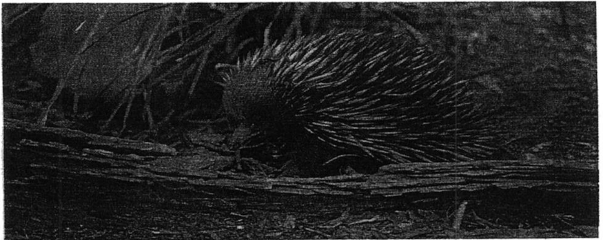
The long tongue of the Short-beaked Echidna is covered with copious saliva to which insects adhere. Above: Tachyglossus aculeatus aculeatus .