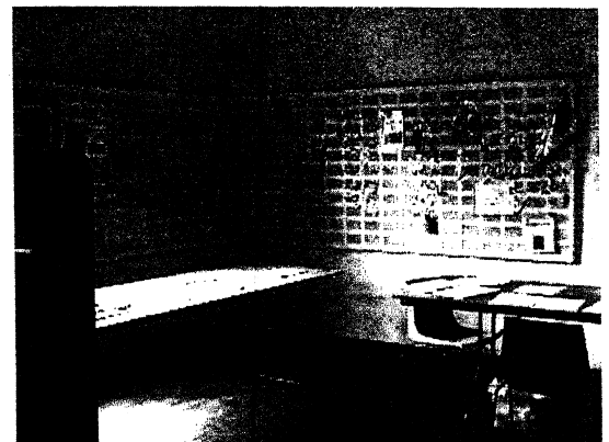
DISPLAY OF ARTIFACTS DUG UP LOCALLY BY ARCHAEOLOGISTS

Poor weather, the petrol costs kept some at home – BUT, don't worry –they'll have another chance to share the Heritage experience next year.